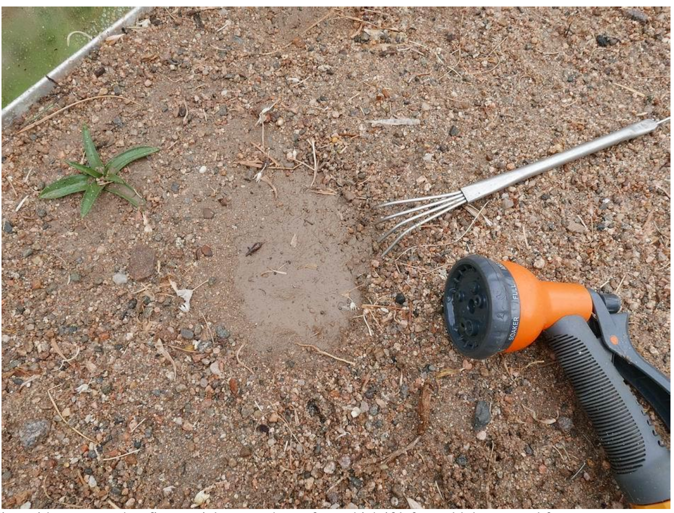
Flooding with water washes fine particles onto the surface which if left would dry out and form a crust preventing water getting down to the bulbs so I always use a small rake or fork to rough up the surface after watering.