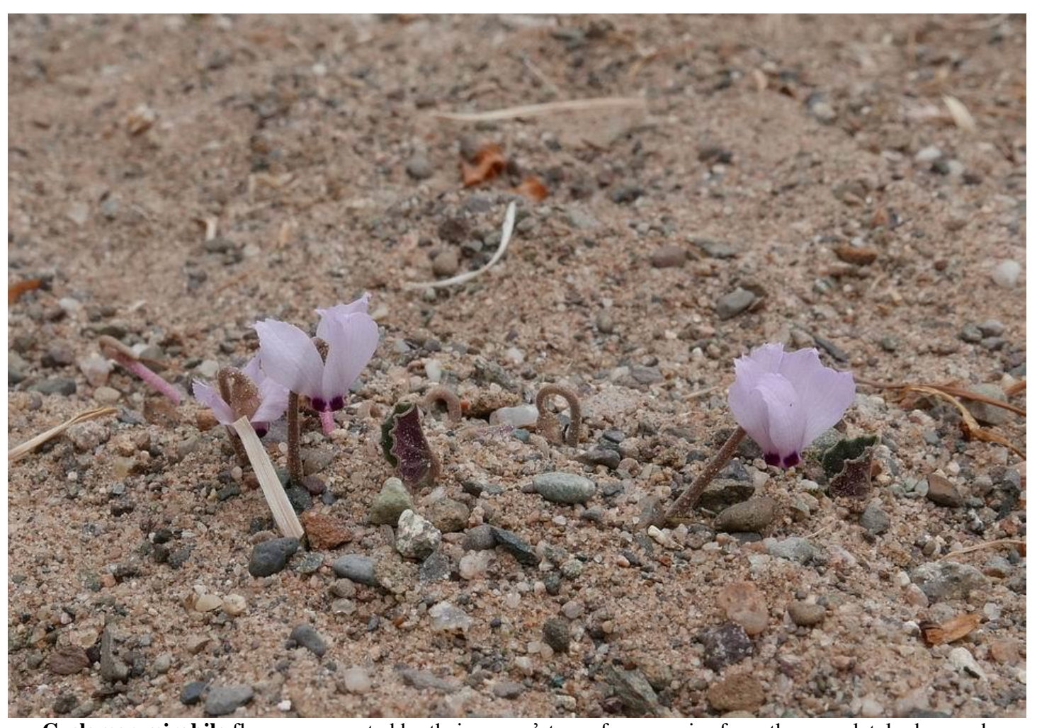
Cyclamen mirabile flowers supported by their corms'store of energy rise from the completely dry sand.