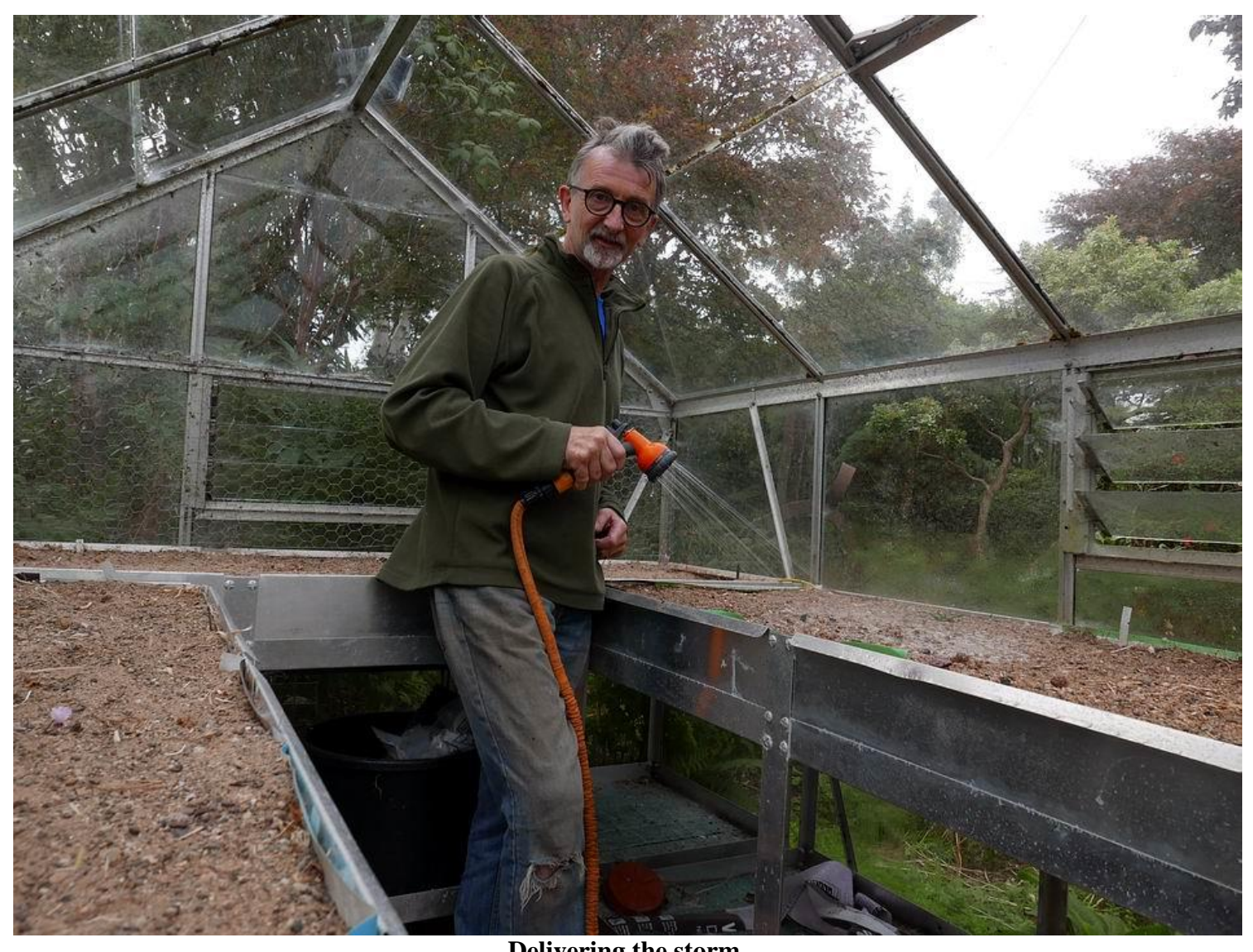
Delivering the storm.