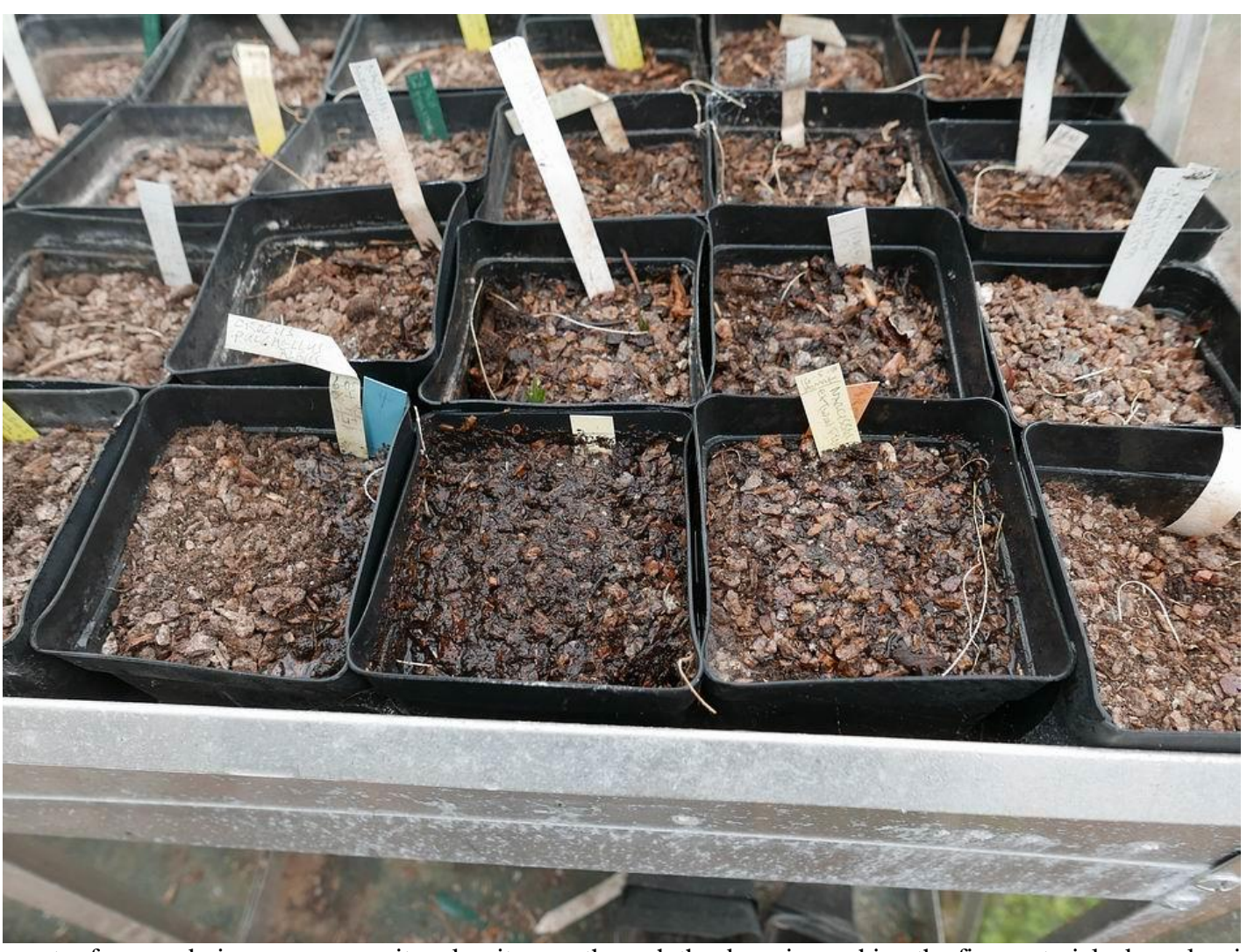
The water forms a drainage course as it makes its way through the dry mix washing the fine materials down leaving a surface of mostly the gravel which makes up fifty percent by volume of my mix.