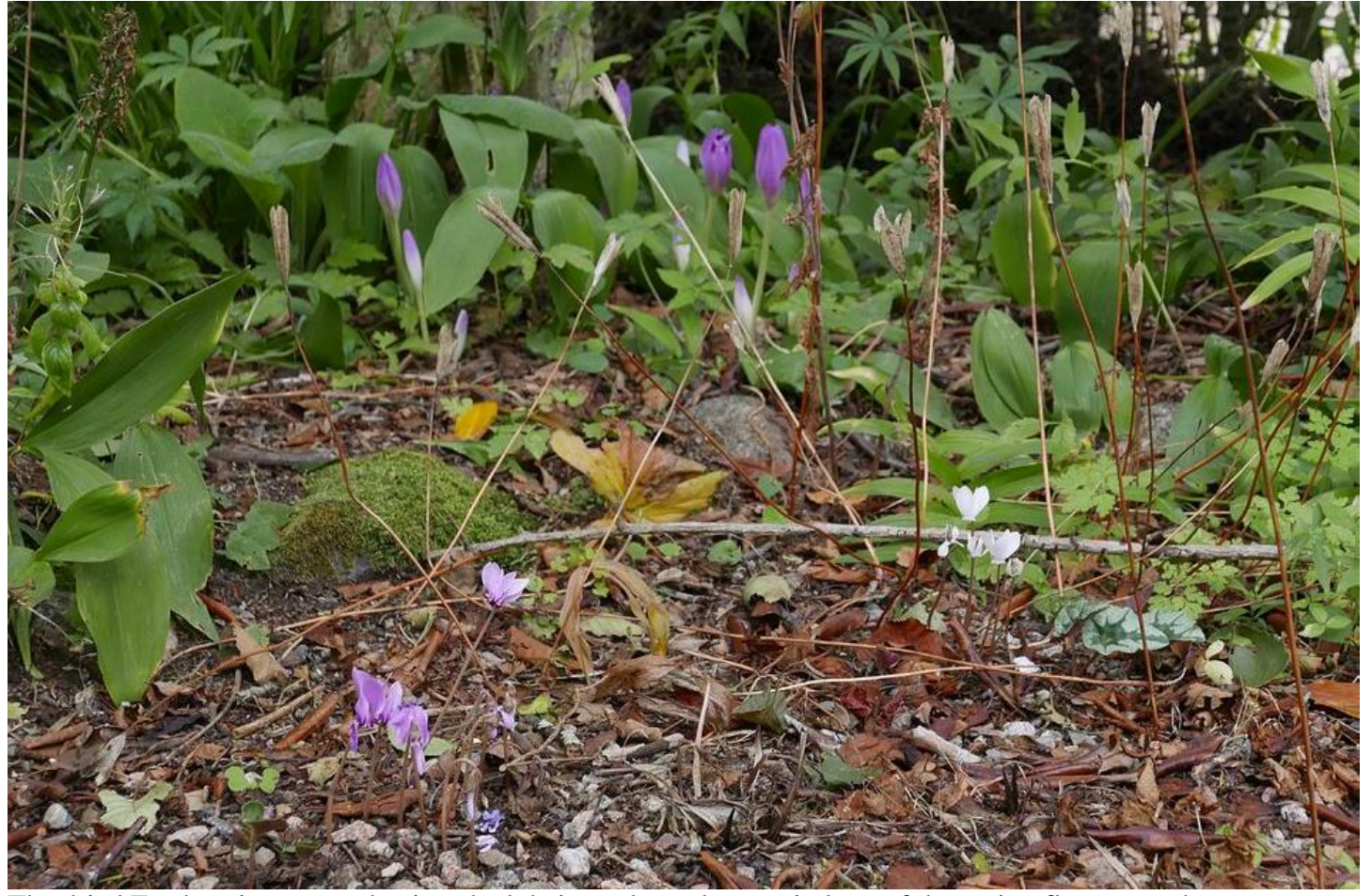
The dried Erythronium stems having shed their seed stand to remind me of the spring flowers as the autumn flowering Colchicum and Cyclamen are starting to bring their colourful display to the garden.