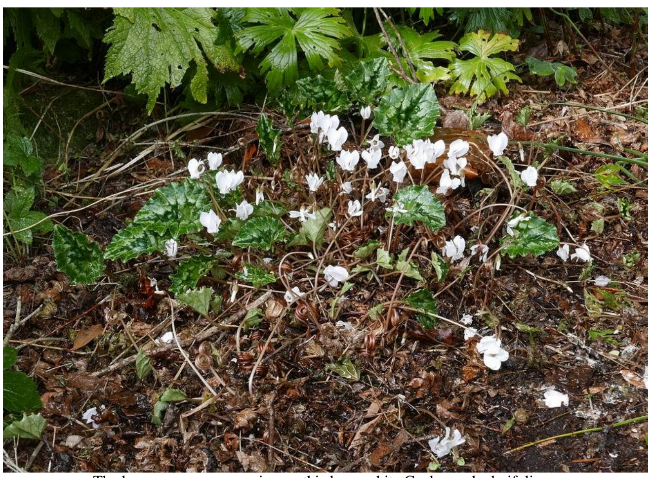
The leaves are now emerging on this large white Cyclamen hederifolium.