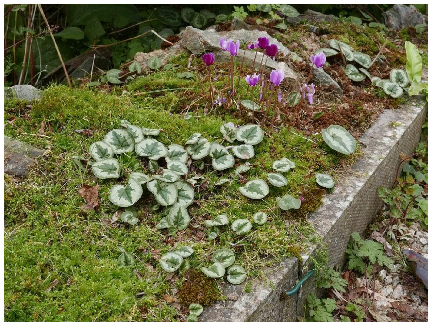
This was one of the first sand beds I built for bulbs in the garden and I continue to use it as an area to experiment in. For many years I spent hours carefully cleaning away all the moss and other plants from the sand until a few years ago I decided I could save myself a lot of effort by leaving the low growth of moss and Sagina (Pearlwort) and the bulbs have continued growing well - just as they do in the wild in harmony with these other plants. I do remove any larger growing plants that seed in which could out-compete the bulbs.