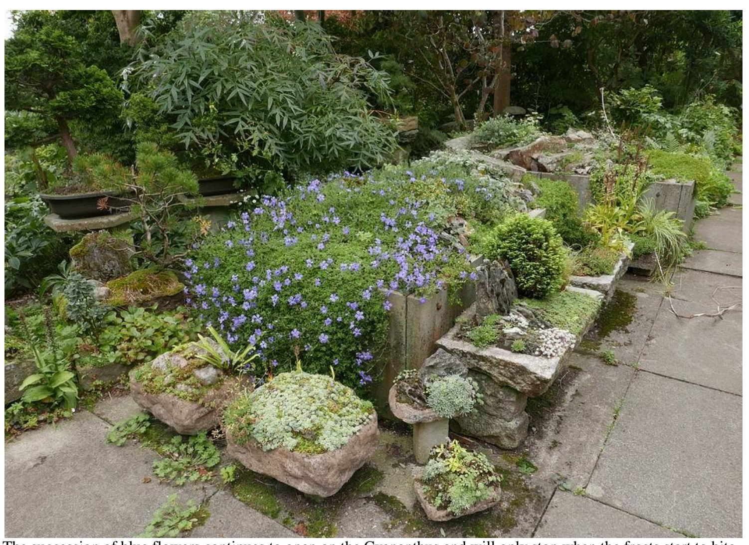
The succession of blue flowers continues to open on the Cyananthus and will only stop when the frosts start to bite.