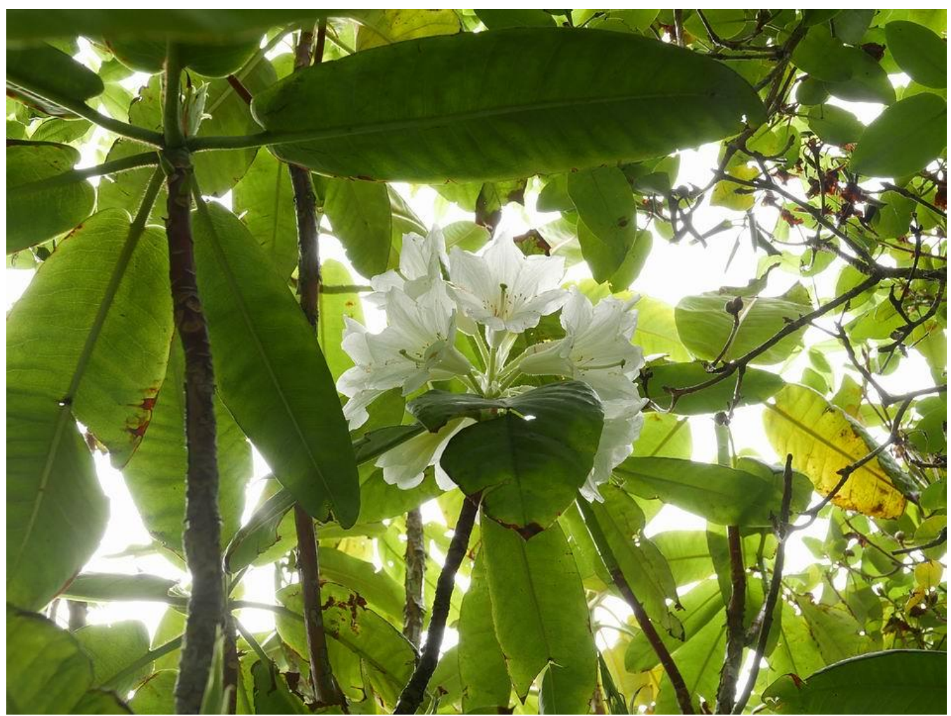
Due to the hot dry summer the beautifully scented Rhododendron auriculatum is also later to come into flower however this is not a secondary flowering this is a late summer flowering species. Until next week......