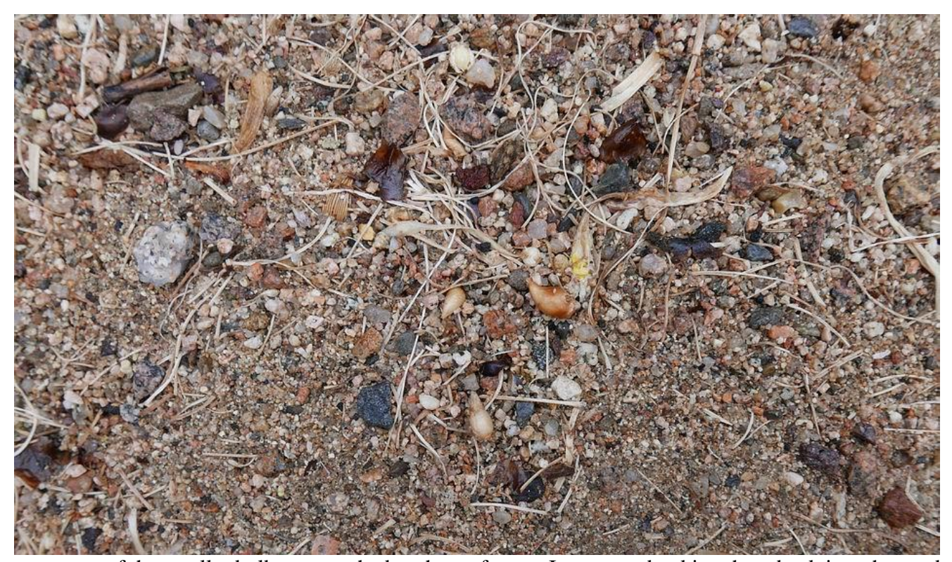
As I water some of the smaller bulbs get washed to the surface so I go around poking them back into the sand.

It is often said that it is the application of water that stimulates the bulbs into growth but I know from my experiences and trials that is only a part of the reason. As I have illustrated many times root activity on bulbs can be initiated even when they are completely dry so they must be responding to some other trigger and I believe that to be changes in temperature. Just like many seeds need to go through a number cycles of freezing and thawing to break dormancy I think bulbs need to go through a sequence of temperature gradients to wake them from their summer rest. The autumn rains that soak the natural habitats of these bulbs will also cause a sudden drop in ground temperature and when I checked the temperature of the sand bed immediately before and after the watering I recorded a significant fall in temperature. My hypothesis is that changes in temperatures stimulate the root tips to emerge and if there is water present they will grow out into the moist ground, if it is still dry they wait or extend very slowly until water is available.