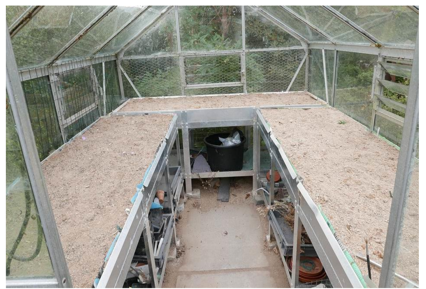
The first of September is an important date not only as the Meteorological start to autumn but also the day I deliver the first storm to the bulbs growing in the bulb houses. Here all the bulbs growing in the sand beds are about to get a thorough soaking to start them off into growth but before I do that let me show you a few that could not wait.