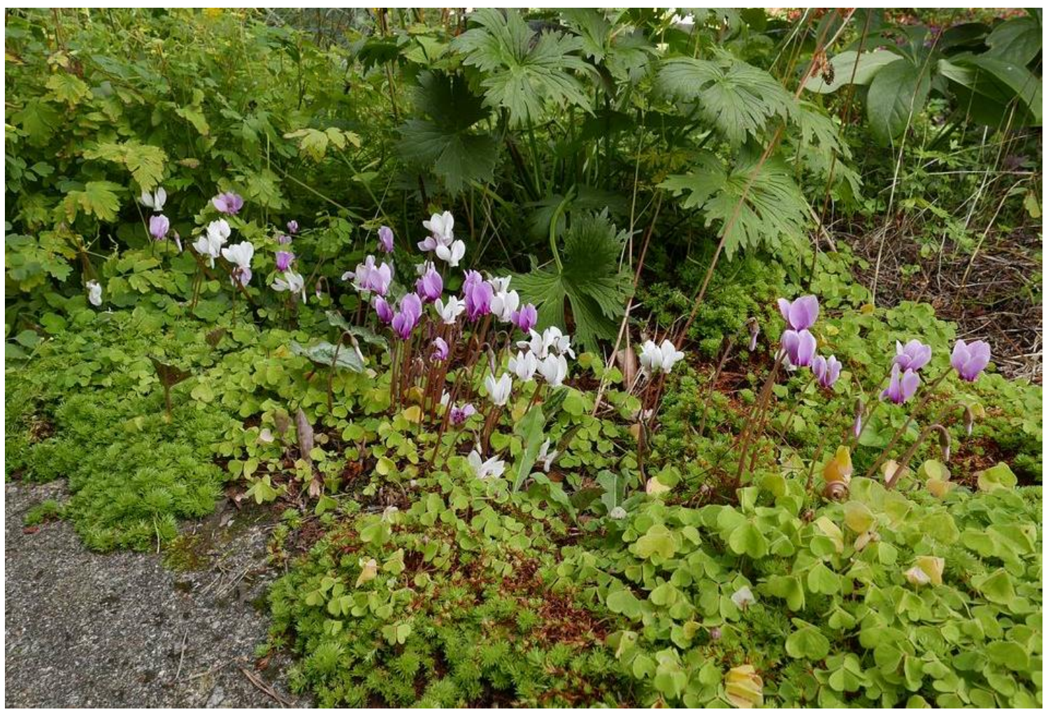
In nature most bulbs grow perfectly happily along with and through other plants as these Cyclamen hederifolium which seeded themselves in with the Oxalis and Saxifraga - self-seeded Crocus and Erythronium also grow here.