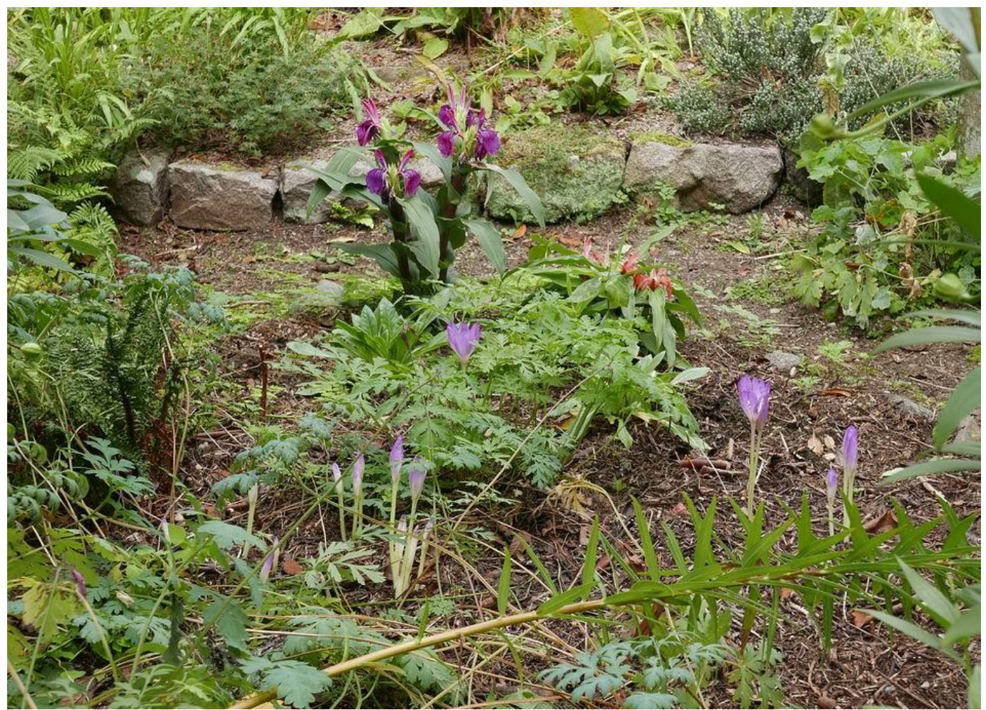
Three to four weeks later than recent years autumn flowering Colchicum are now starting to make their appearance all around the garden. These are some in the corner of the bed where I removed a rhododendron and thinned the Dicentra - the colchicum bulbs, lying deeper in the ground, were undisturbed.