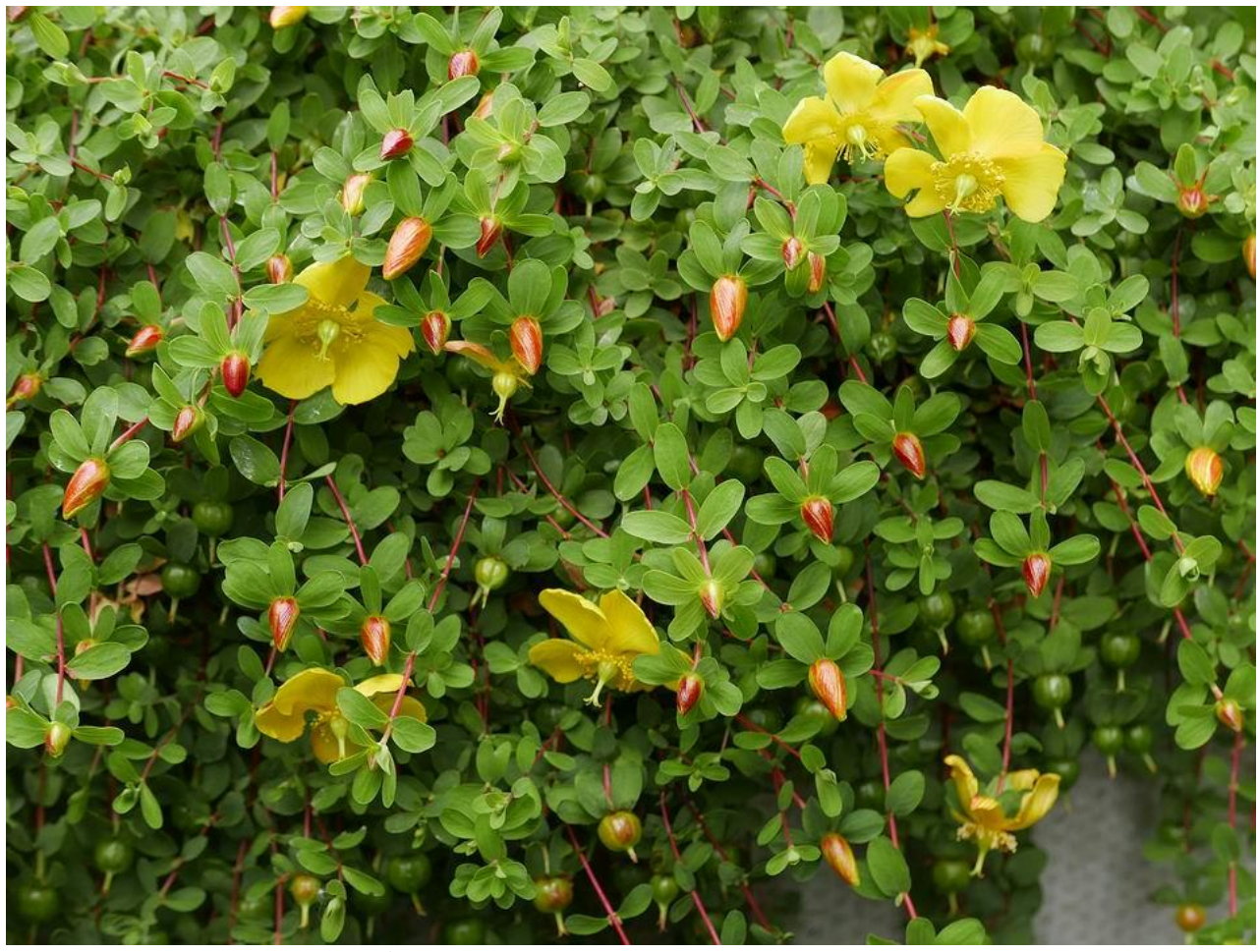
Similarly the yellow flowers of Hypericum reptans which trail over the edges of the slab beds have added their colour through the summer which they will continue to do for some months to come.