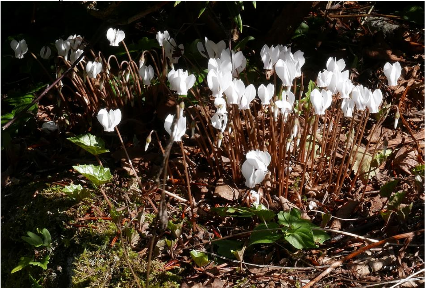
Moving in close I am able to adjust the exposure for the white flowers.

There is a change in light in autumn as the sun sinks down in the sky casting longer shadows with deeper contrast between light and shade – the details of the white flowered Cyclamen hederifolium are burnt out as the camera tries to balance the light and darks of this scene.