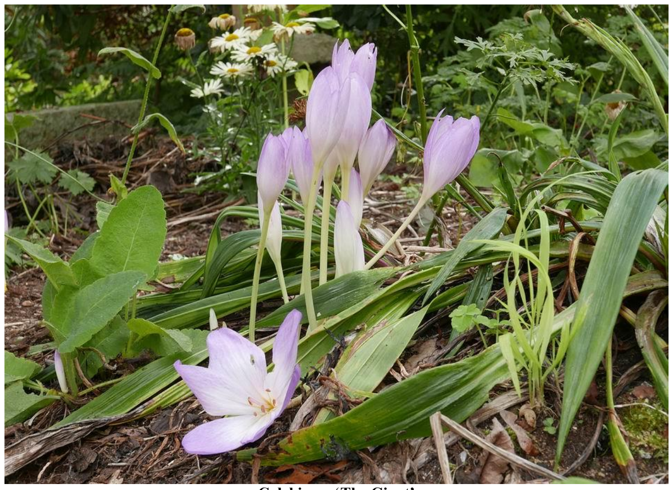
Colchicum 'The Giant'