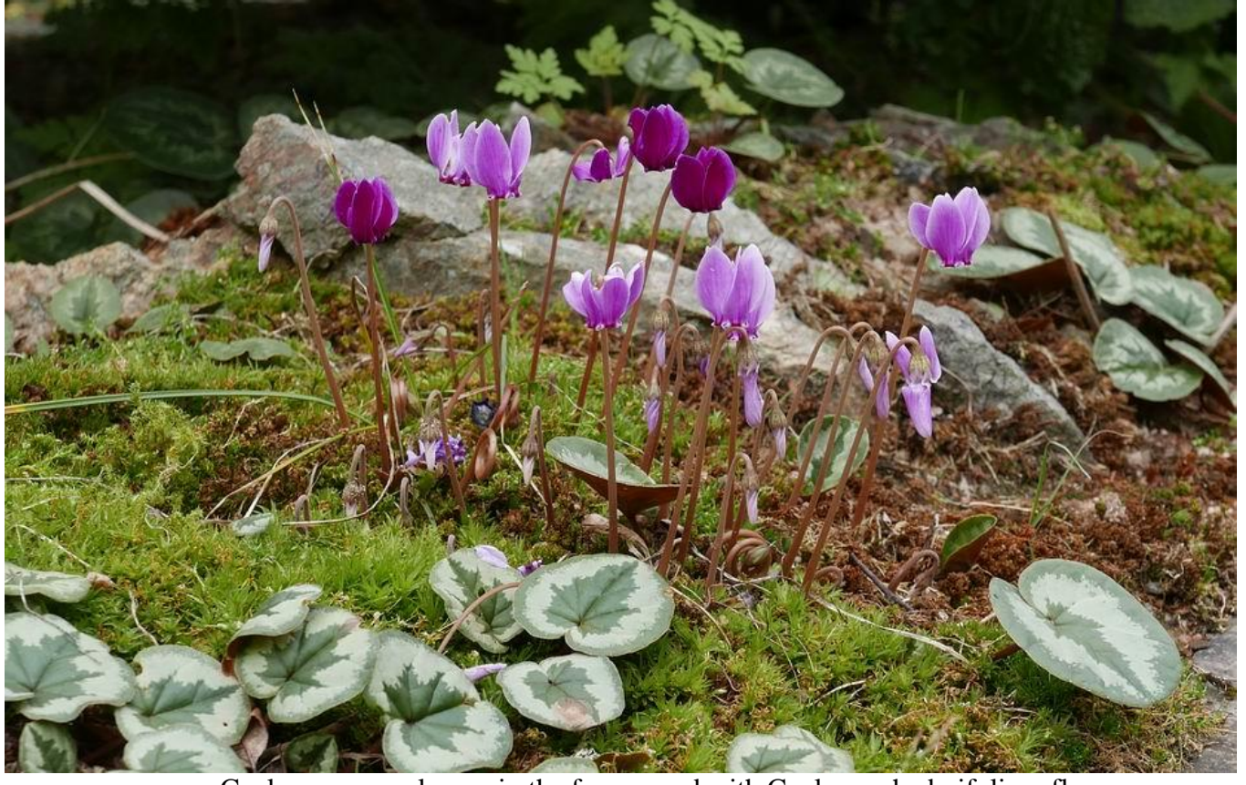
Cyclamen coum leaves in the foreground with Cyclamen hederifolium flowers.