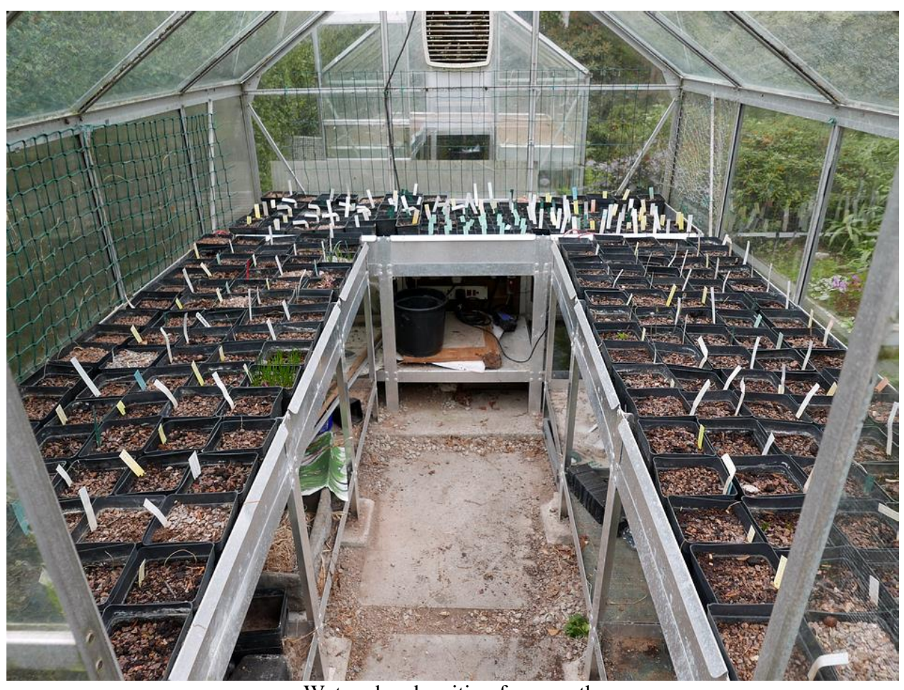
Watered and waiting for growth.