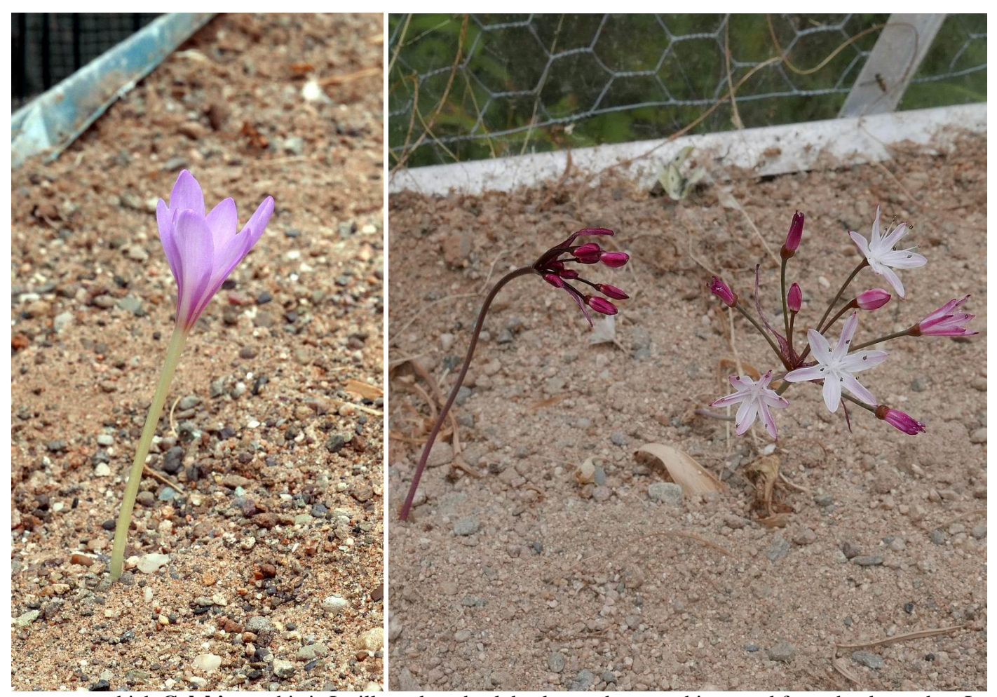
I am not sure which Colchicum this is I will need to check back my photographic record from the days when I grew it in a pot with a label. Also some more flowers have appeared on these newcomers to us, Strumaria karooica .