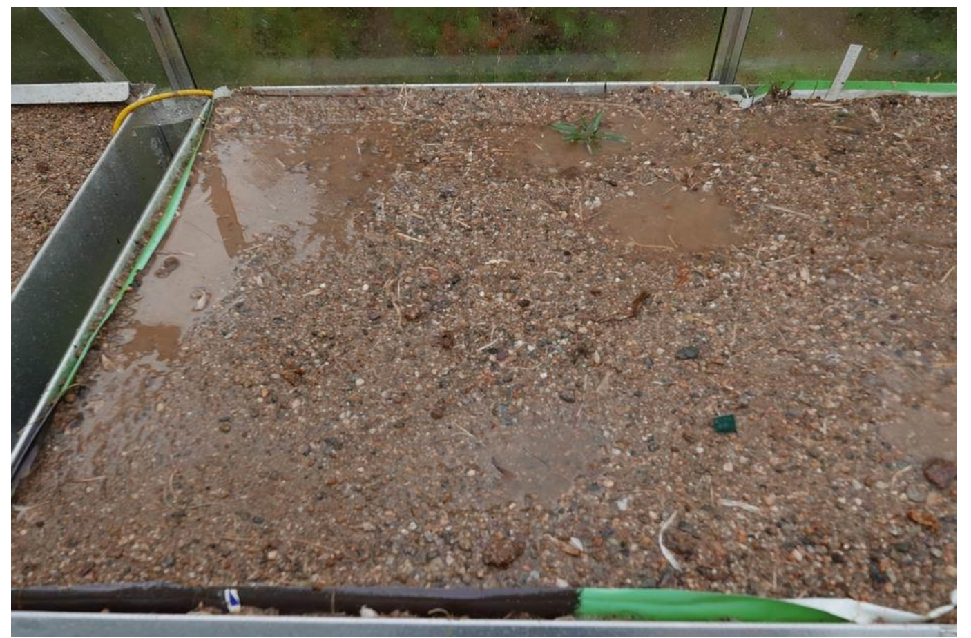
I continue to spray water flooding the sand then allowing it to drain until I am sure that it is wet through - because of my drainage system (see <u>Bulb Log 3113</u> for details) I was able to see when water was draining out below.