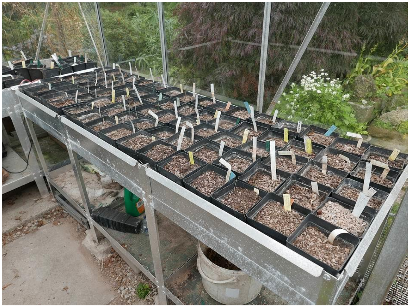
The bulbs growing in pots require the same attention to ensure they get a complete soaking not just to the mixture in the pots but also of the sand below.